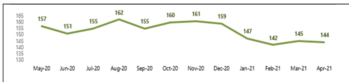
Children in Care (April 20 – Dec 20)

2.13. In November, we witnessed a marked decline in the number of children in our care. This decline was a result of a number of children turning 18 at the same time.